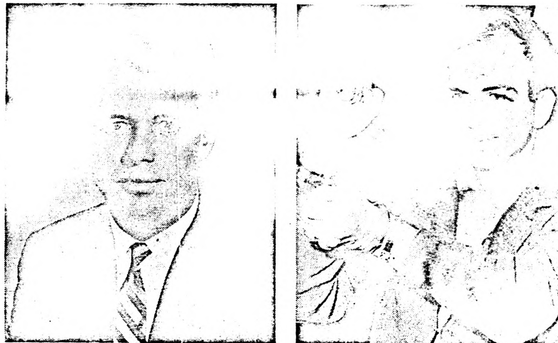
Bobby Kennedy's family fears that the late President's brother will some day come face-to-face with his own Oswald.

have to associate with him, and who are involved in a question of their position. . .