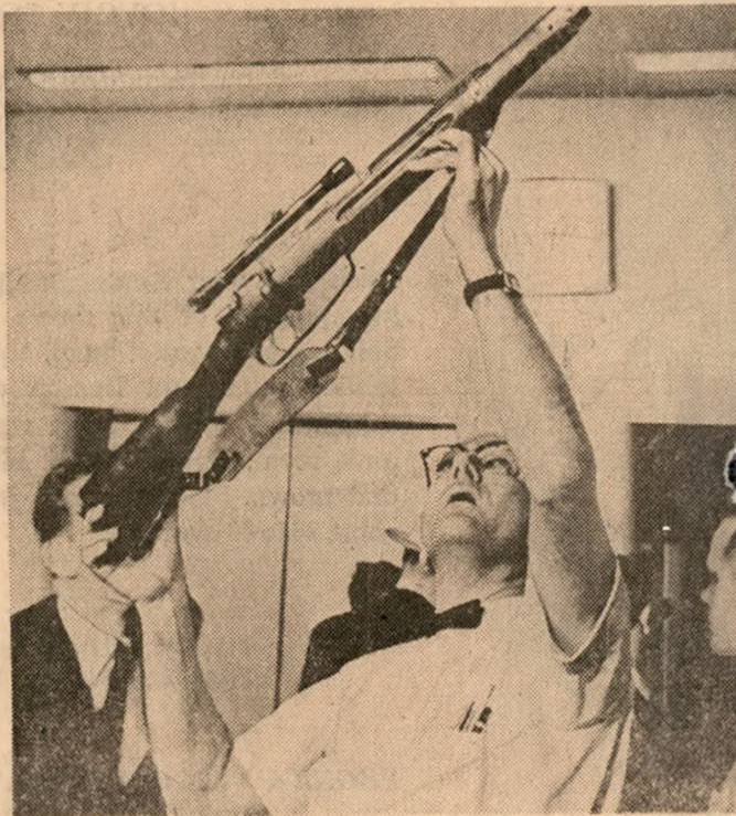
THE MAIL ORDER RIFLE that was used to kill President John F. Kennedy is inspected by a member of the Dallas police department. Congress is now considering a bill that would limit the sale of handguns but not rifles and shotguns.

At the same time, the House rules committee adopted a resolution by Rep. John B. Anderson, (R-Ill.) making it possible to vote on the Senate bill