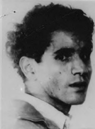
SIRHAN BISHARA SIRHAN, male, Arab, born [REDACTED] Jerusalem, 5'3", 120 #, brown hair, brown eyes