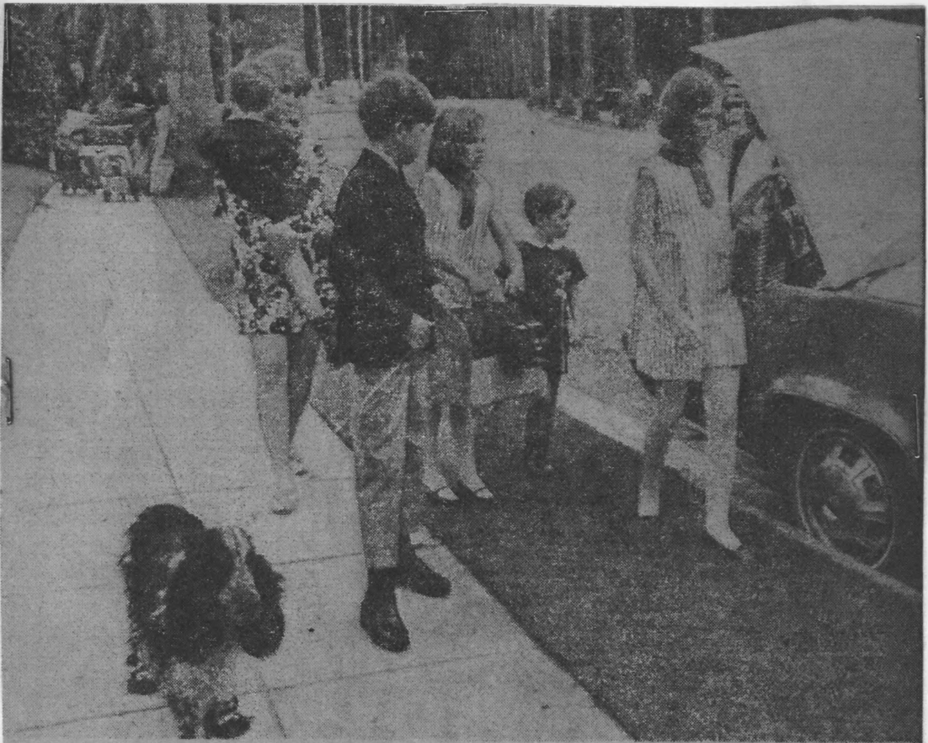
KENNEDY CHILDREN FLOWN HOME —Six of the 10 Kennedy children, accompanied by their dog, Freckles, leave Beverly Hills en route to Los Angeles International Airport. They were flown to Washington aboard Air Force plane supplied by Vice President Hubert H. Humphrey. Children were accompanied by former astronaut John Glenn and his wife.