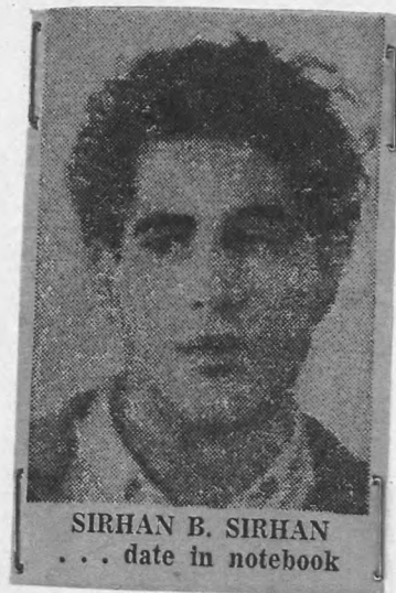
SIRHAN B. SIRHAN ... date in notebook