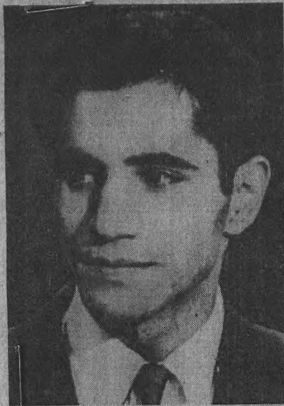
Sirhan B. Sirhan