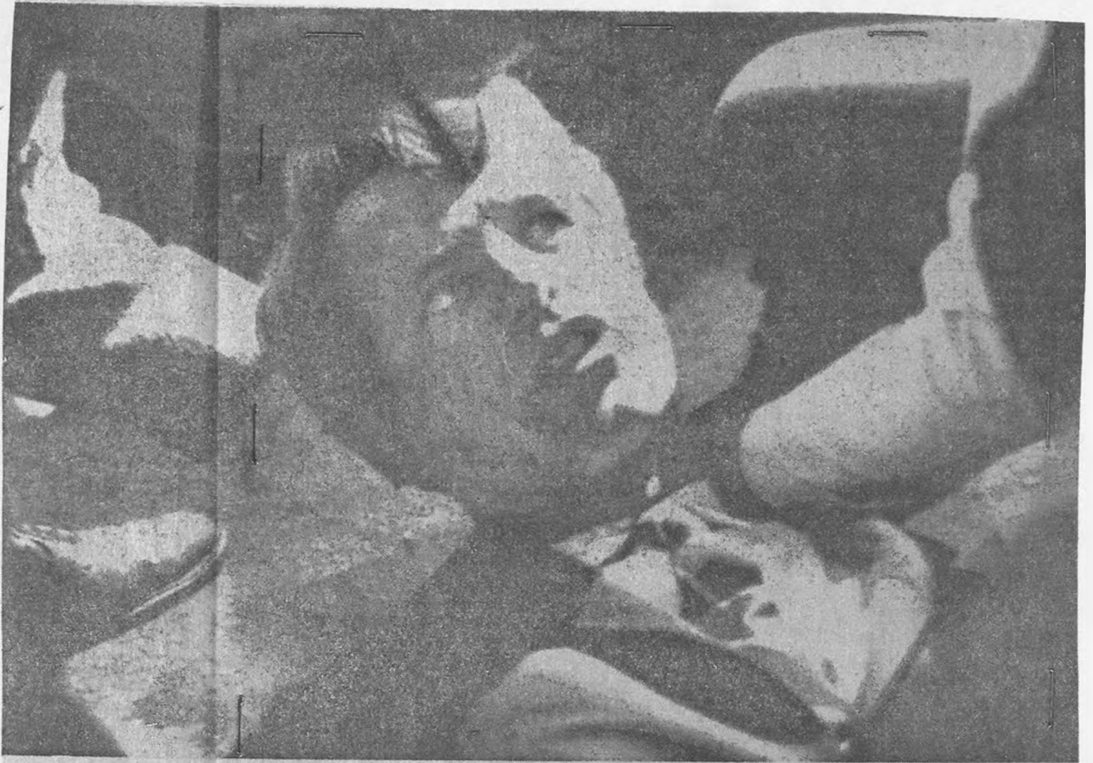
MOMENTS AFTER SHOOTING —Sen. Robert Kennedy lies gravely wounded on the floor at Ambassador Hotel in Los Angeles shortly after being shot at a California primary victory celebration. The