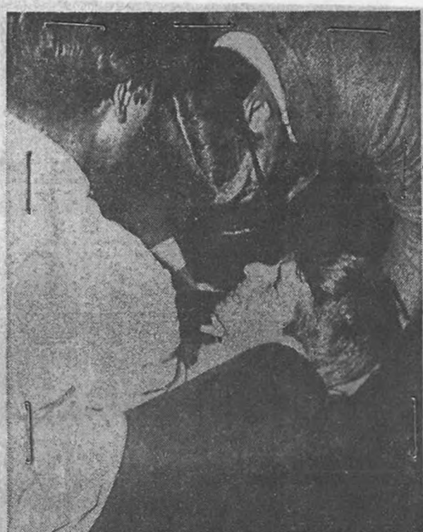
POOL OF BLOOD — Sen. Robert F. Kennedy lies on floor of anteroom just off main ballroom of Ambassador Hotel after being shot early Wednesday.

Pg.1 San Jose Mercury San Jose, Calif. 6-5-68