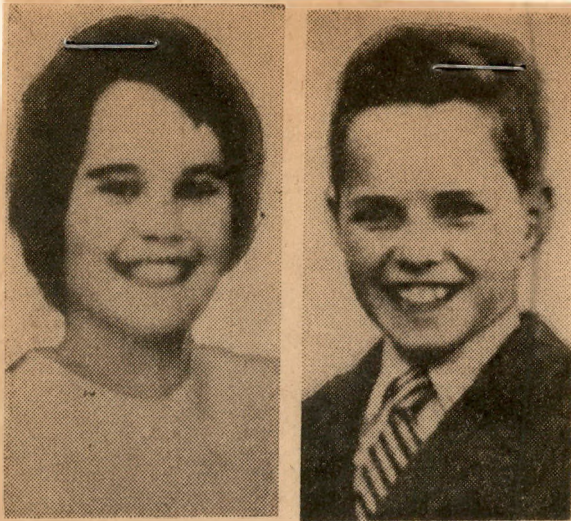
KATHLEEN AND JOE KENNEDY A warning overheard