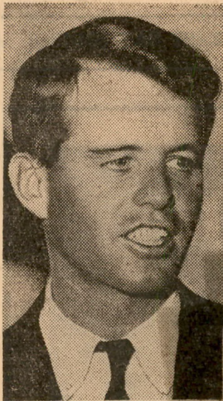
ROBERT F. KENNEDY "He'll be an easy target"

"Something has to be done about that little S.O.B., Bobby Kennedy," a top teamster official was quoted as saying. "He'll be an easy target, always driving around Washington in that convertible