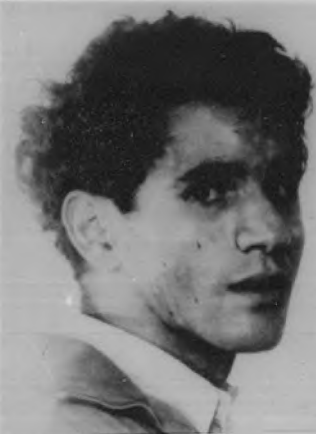
SIRHAN BISHARA SIRHAN, male, Arab, born 3/19/44 Jerusalem, 5'3", 120 #, brown hair, brown eyes