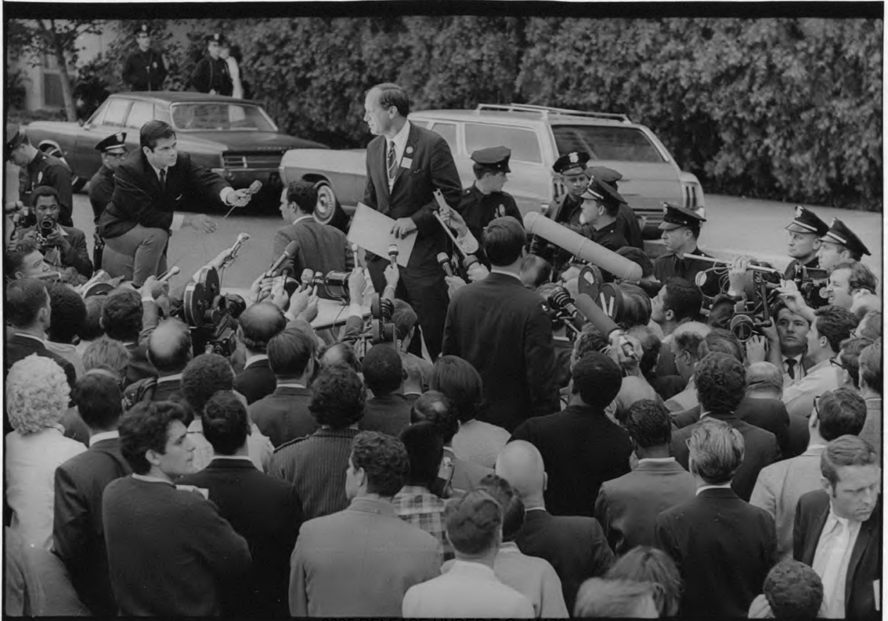
2025 RELEASE UNDER E.O. 14176