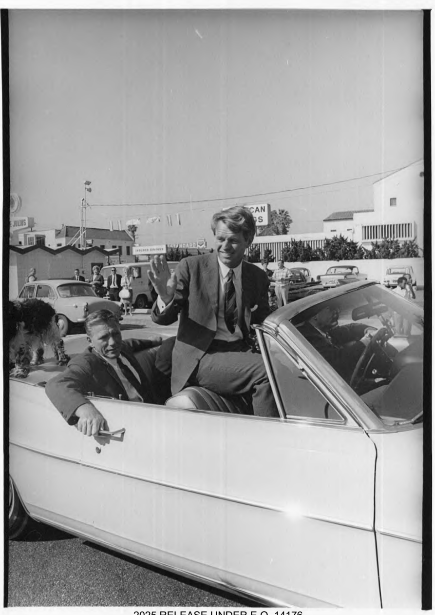
2025 RELEASE UNDER E.O. 14176