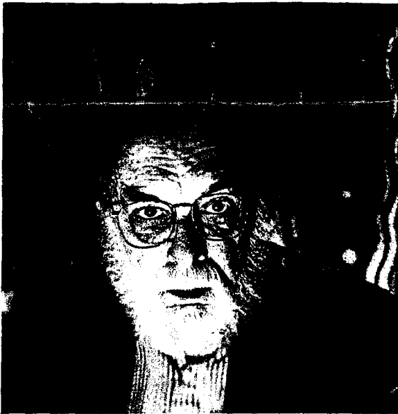
THE AMAZING RANDI exposes all manner of pseudoscience and the paranormal.

Despite exposing charlatans, Randi does not hesitate to practice some flummery. In explaining the art of deception, he is all too ready to bend a couple of spoons and to make sugar packets and crumpled paper napkins disappear.